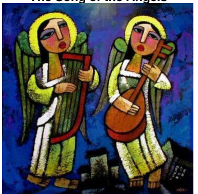
Christchurch Woking Saturday 9<sup>th</sup> December at 7pm