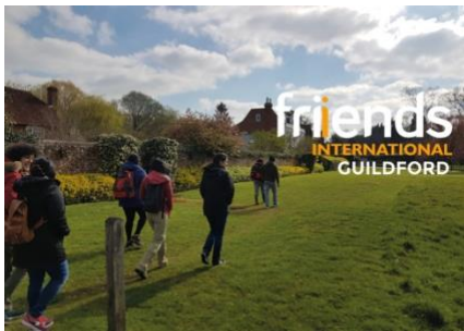
Friends International Guildford (aka 'FIG') – prayer breakfast focus in March